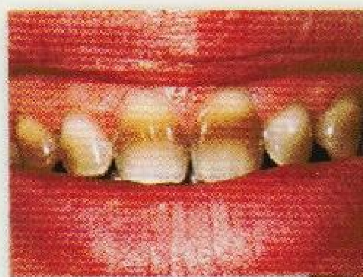
Beautify stained and discolored teeth.