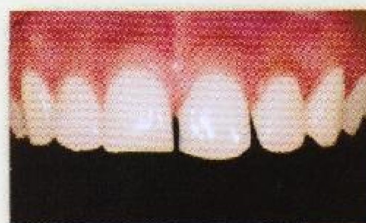
Close unsightly spaces between teeth.