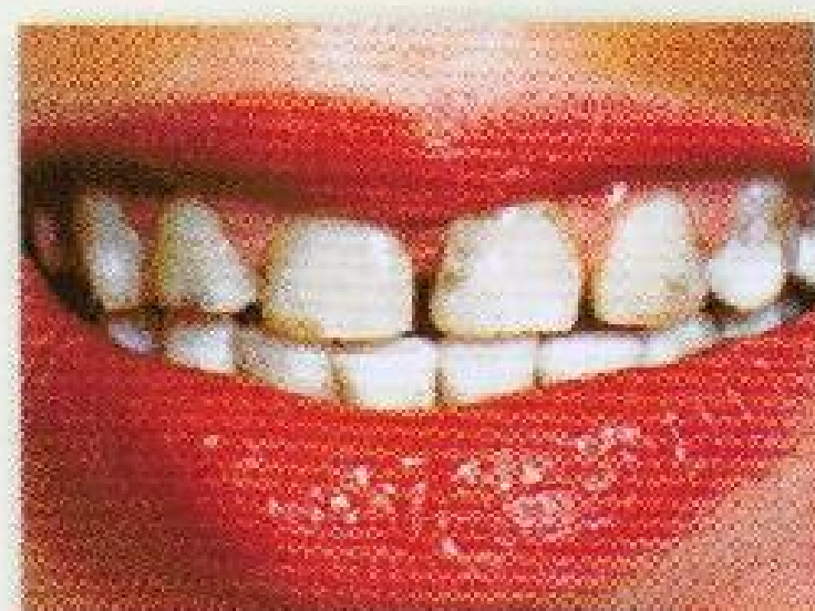
For cracked, fractured or injured teeth.

And while many of these same improvements can be accomplished with orthodontics (braces) and bleaching (whitening), one of the great advantages of veneers is that they are typically finished in as little as 2 weeks, while many orthodontic cases can take 2 years. That makes porcelain veneers a great choice for many adults who don't want to wait 2 years for results, and may have already worn braces in the past. Ask your dentist if porcelain veneers may be right for you!